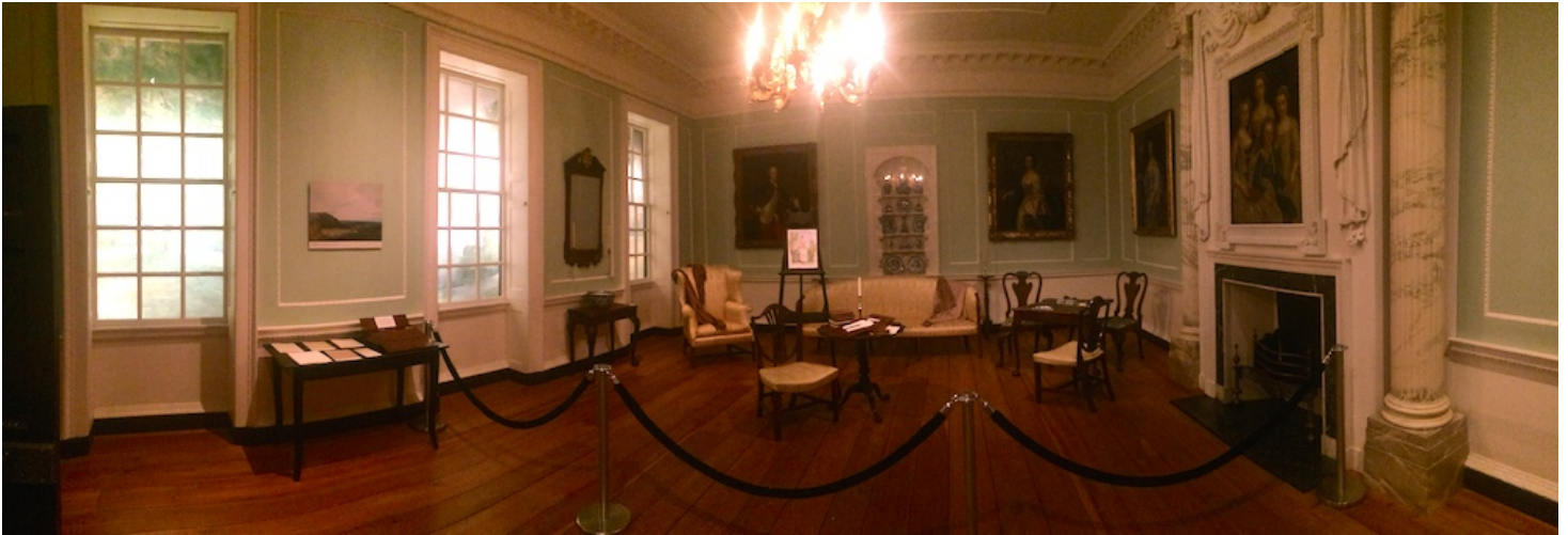
THE JANE AUSTEN READING ROOM AT MIA.

I'm not afraid to admit my obsession with Pride & Prejudice . Whether it's the original book, or the Colin Firth five-hour adaptation, the more common Keira Knightley/Matthew Macfayden film, or the recent spin-off Pride & Prejudice & Zombies , doesn't every girl dream of dancing in a ballroom with Mr. Darcy?